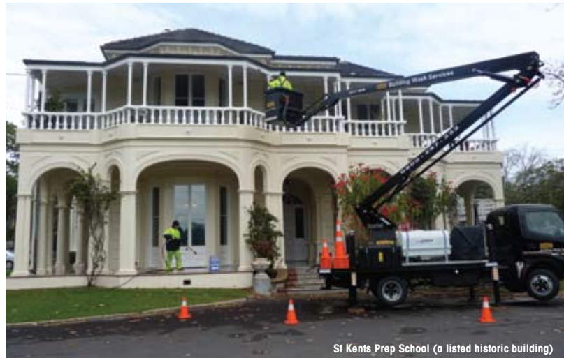
St Kents Prep School (a listed historic building)

BWS reaches high risk areas that ground based operators can't reach to wash down corrosive deposits.