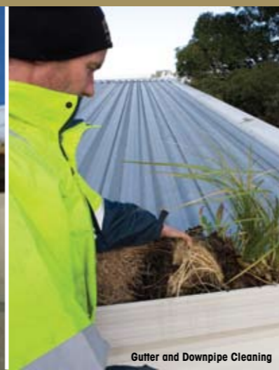
Gutter and Downpipe Cleaning