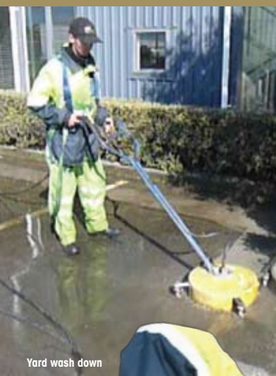
Yard wash down

Major suppliers all agree that an annual building wash is vital to protect the exterior surfaces from the elements. Failure to do so is likely to void your warranties. A BWS building wash programme is well suited to meeting this requirement.