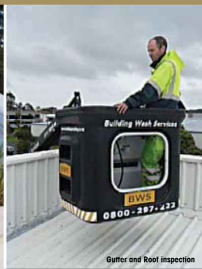
Gutter and Roof Inspection