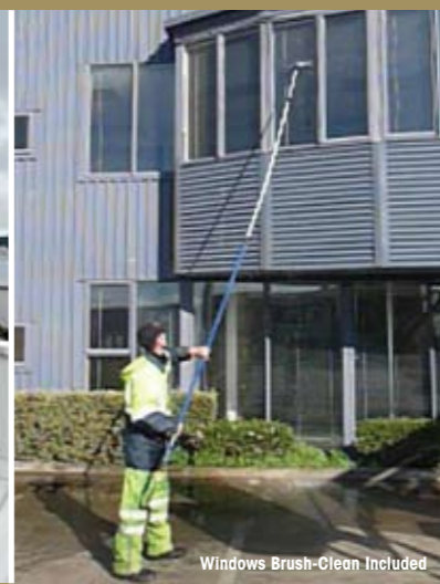
Windows Brush-Clean Included