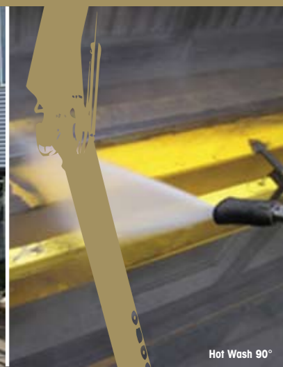
Hot Wash 90°